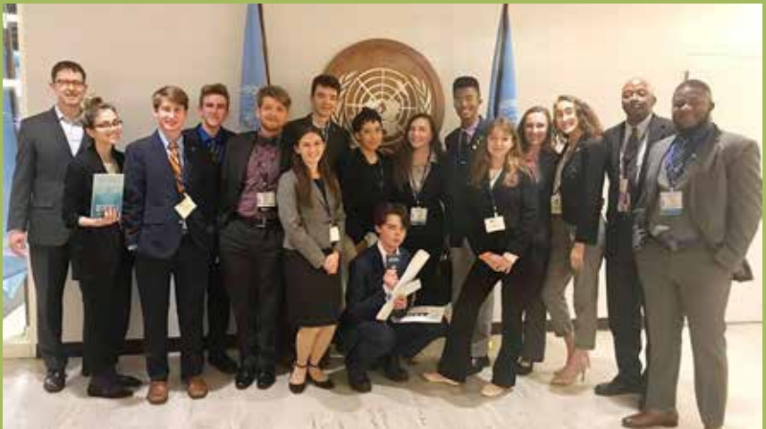
SPC's award-winning Model U.N. team at the National Model United Nations Conference in New York.