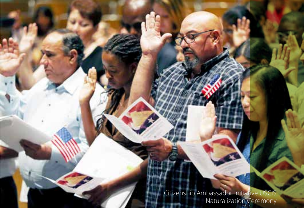
Citizenship Ambassador Initiative USCIS Naturalization Ceremony