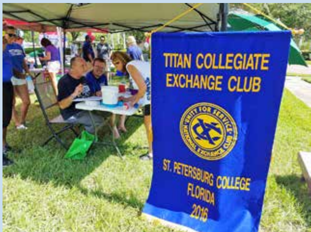
Human Services Program students participate in community engagement.

The Social/Behavioral Sciences and Human Services Division collaborates with the Sixth Judicial Circuit Outreach of the Public Defender's Office in a psychology internship program. Select SPC students complete a four-hour training in Milieu or Group therapy, and an eight-hour training in working with homeless populations. The interns then begin a shadowing and skill-development process, prior to working with residents in small teams and facilitating listening groups. In partnership with Pinellas Safe Harbor, St. Petersburg College students are working with the local homeless population to provide support, identify areas of need, and connect residents to community resources.