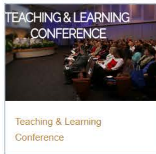
Teaching & Learning Conference