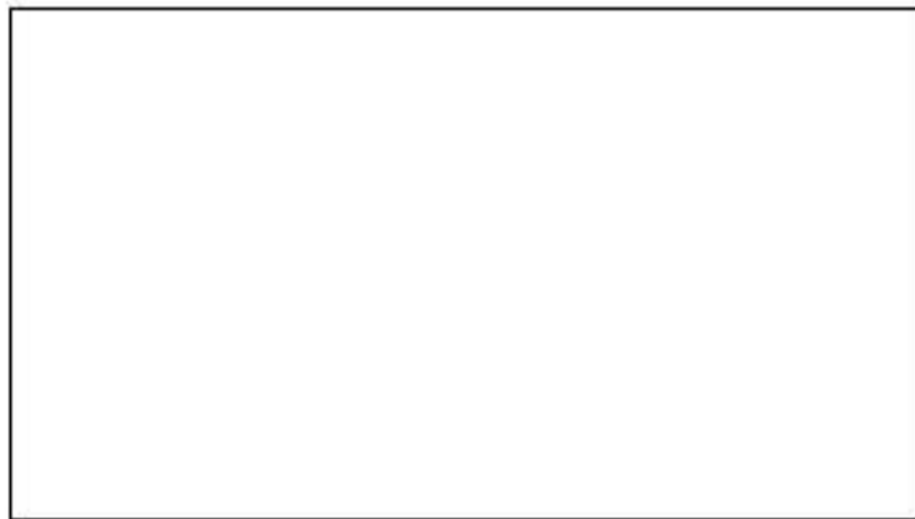
Accreditation information for students

See information about accreditation and learn how it works in the US. Also, gain access to helpful resource documents and links to other organizations in higher education and accreditation.