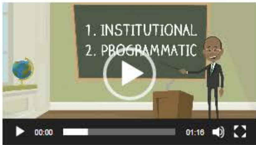
The importance of programmatic accreditation