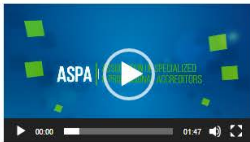
Benefits of ASPA membership